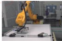
Disassemble the lead